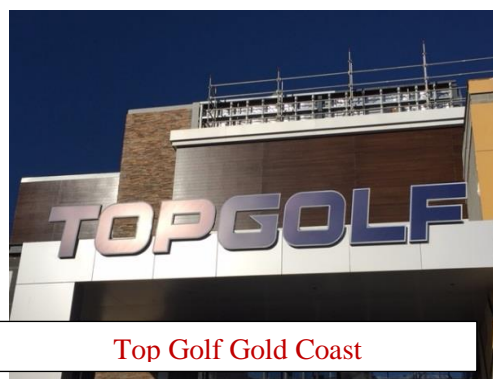
Top Golf Gold Coast