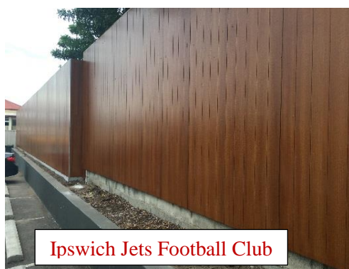
Ipswich Jets Football Club

Other Poly-Tek Products include Sun Hoods & Blades, Letterboxes, Fencing