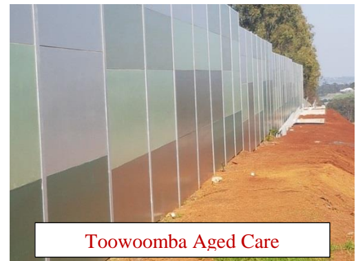
Toowoomba Aged Care

Cladding * Soffits * Alfresco Roofs * Fencing * Balcony Features